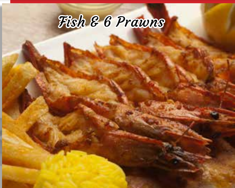
Fish & 6 Prawns